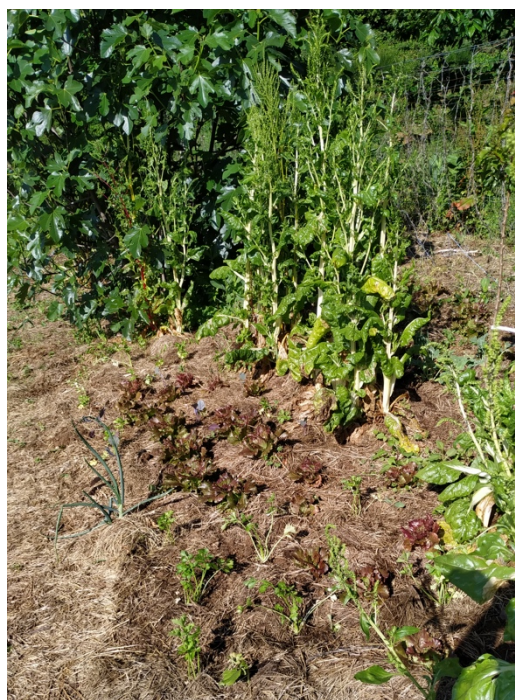
Planting of lettuce and parsley in an organic mulch, and seeded chard for self-production of seeds