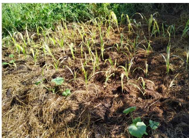
Planting of Alliaceae and Cucurbitaceae in a hay-based mulch

However, this change in practice has created some difficulties, in particular in controlling certain pests . During the first three years, Didier Flipo observed a great abundance of slugs under the hay. They are attracted to this environment sheltered from the sun. After a few years of mulching, the damage caused by slugs has diminished. Didier explains this decrease by the establishment of predators and by the change in the slug diet following the development of soil microorganisms (in particular fungi, preferred meal of slugs). He also observed a few more voles than with plastic mulch, but the damage is still acceptable.