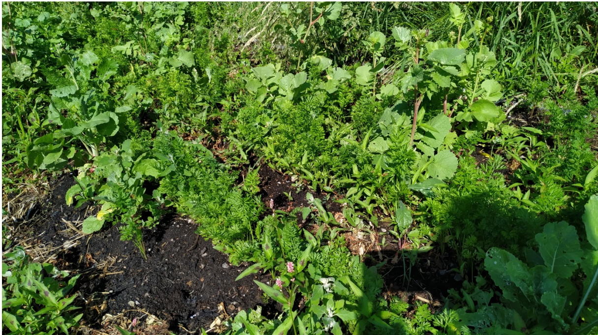
Sowing carrots in green waste compost, and seeded radish for self-production of seeds